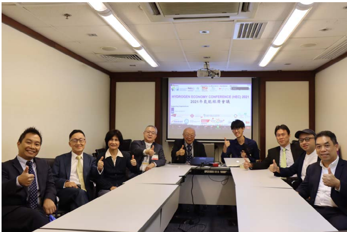
Group Photo of the Organizing Committee of HEC2021 at the Conclusion of the Conference, Celebrating another Great Conference and Great Success!